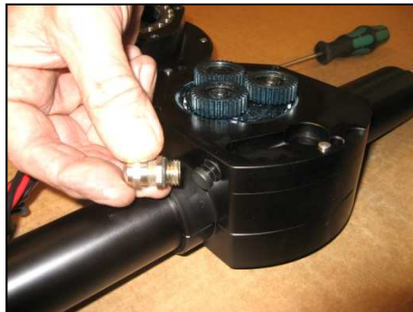
Pull out plastic plug to mount the cable screw