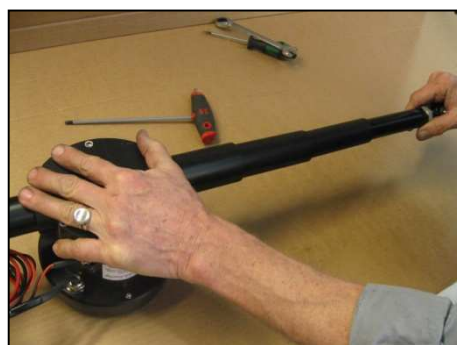
Pull drive arm out to stop