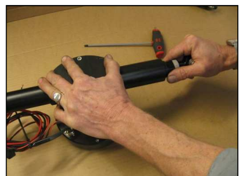
Push drive arm in to stop. Installation of the rudder feed back is done.