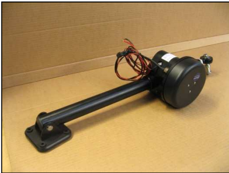
Manual to install rudder feed back in Jefa DU-LD-12