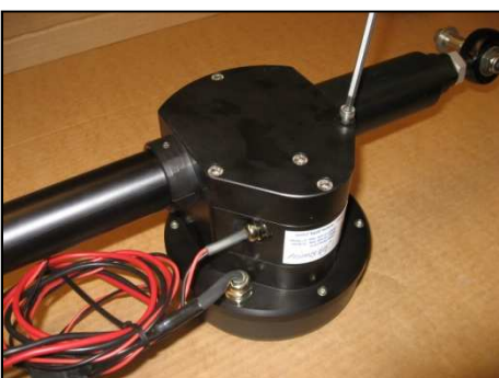
Mount 4pcs of screw to assemble the drive unit