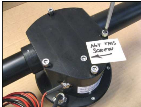
Unscrew 4pcs of screw. NB!! Do not dismount screw in the center, only 4pcs in edge