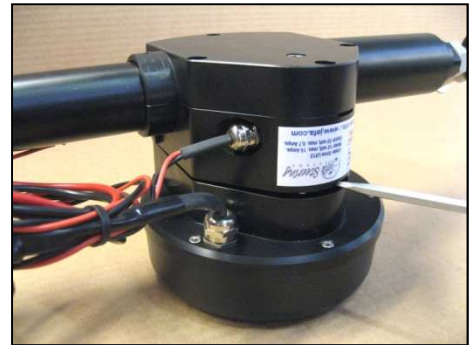
Use flat screwdriver or flat tool to pull housings apart