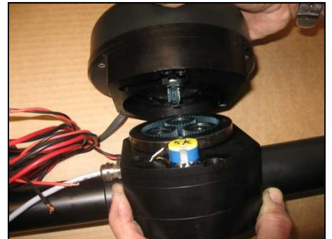
Assemble housings, and make sure that the gearwheels are fitting