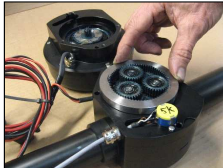
Take gearwheel from top housing and mount it on the gearwheels on bottom housing