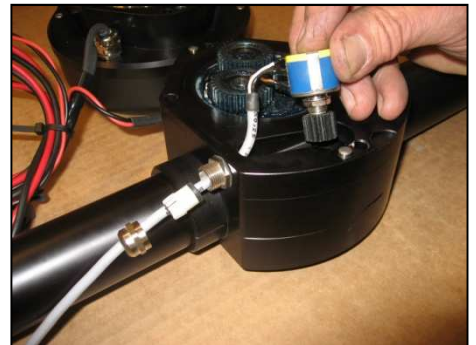
Mount the rudder feed back. NB!!! Do not use hammer on rudder feed back, only use hands